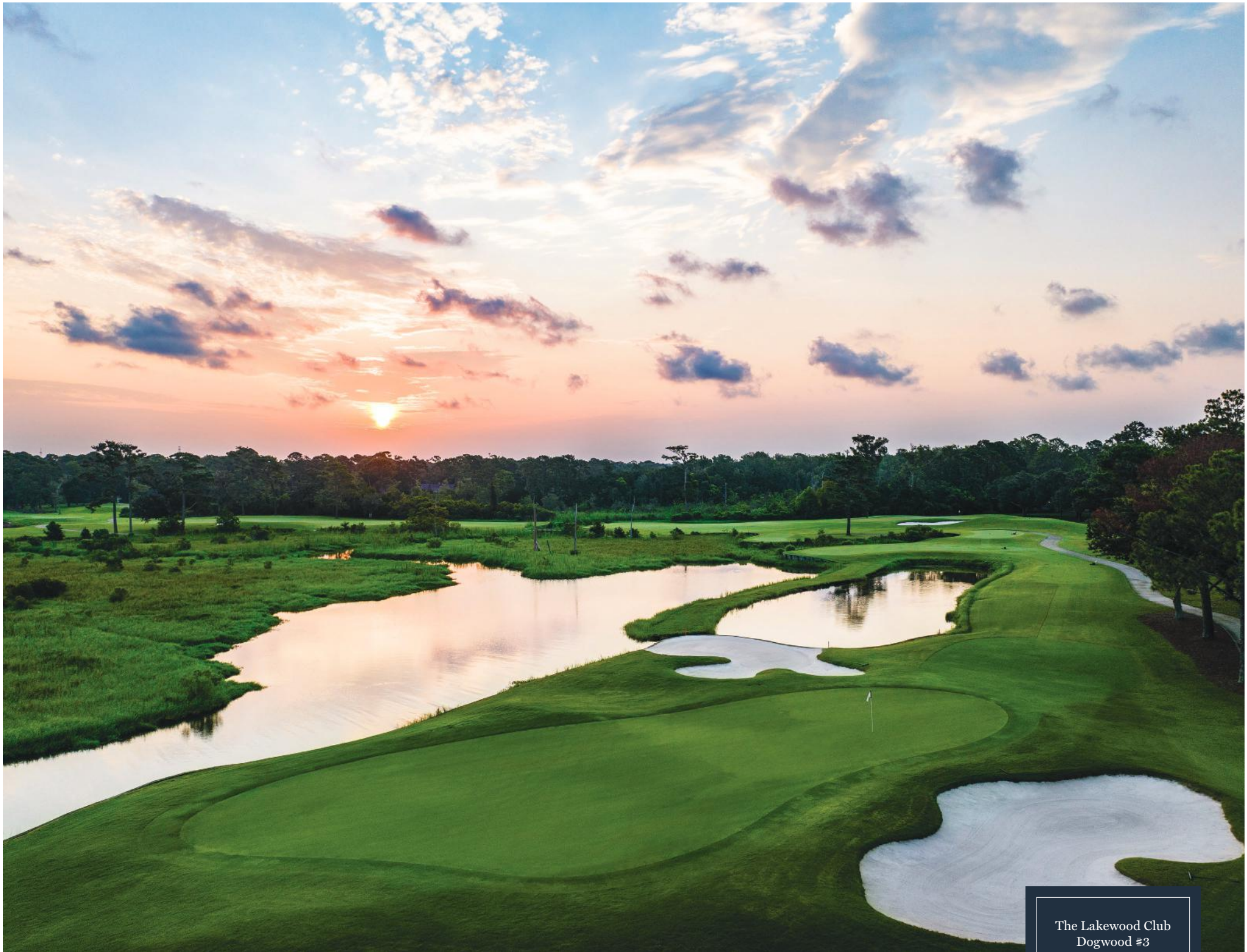
The Lakewood Club Dogwood #3