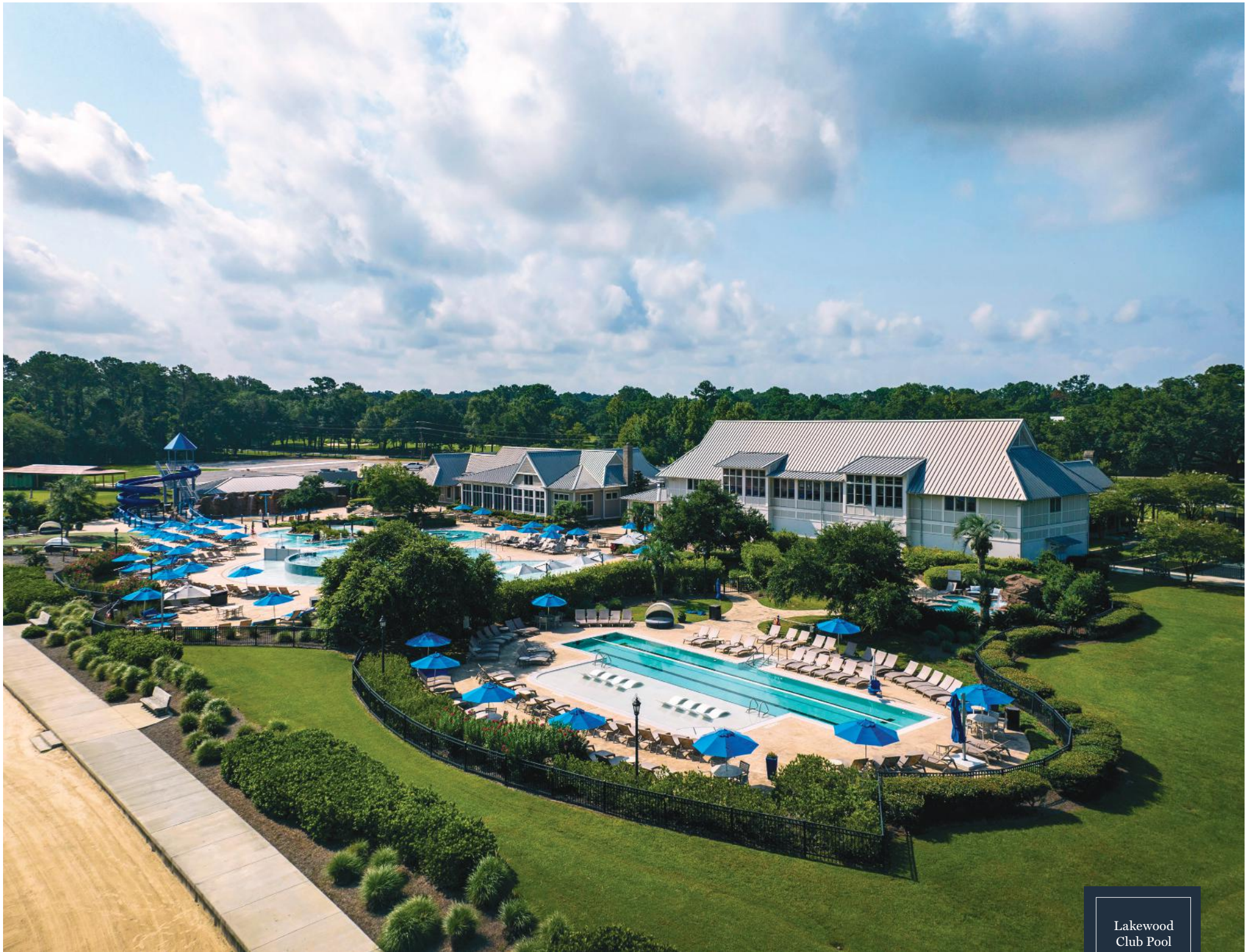
Lakewood Club Pool